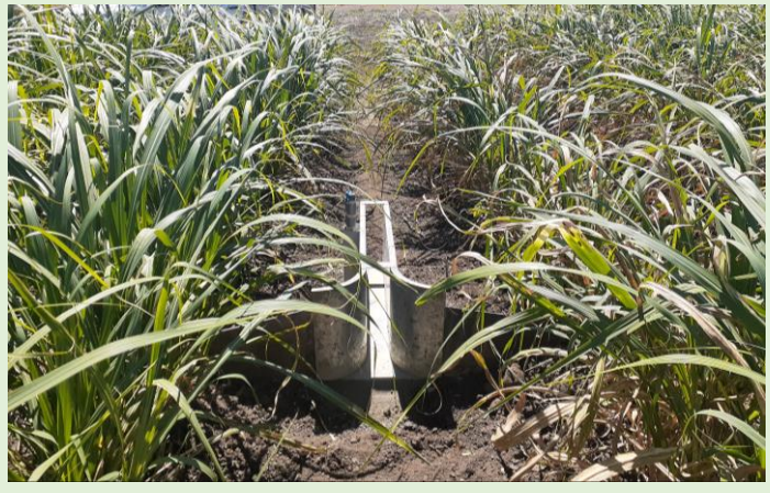
San Dimas flumes and water depth loggers are installed at the bottom end of the paddock at all sites for runoff volume monitoring. At the high input sites, KP water samplers are also installed for nutrient and pesticide water quality monitoring.

The BIP is led by Sugar Research Australia (SRA) and delivered by a consortium of cross-disciplinary stakeholders. The project aims to transition growers to scalable, sustainable, and technologically assisted practices in irrigation management, using a whole-ofsystems approach that includes water quality validation by BBIFMAC.