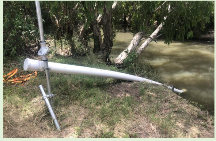
One of the real-time monitoring sites in the Barratta system which is being installed as part of the Fine Scale Water Quality Monitoring Project. The infrastructure is complete, but the sensors have been delayed from Germany.

The Department of Environment and Science (DES) Water Quality team will be coming to the Burdekin in late October to complete the installation of four new sites in the Barratta Creek system. These sites will monitor nitrate-nitrogen, total suspended solids, and stream height in real-time as part of the Fine Scale Water Quality Monitoring Project. The results will be uploaded to the CSIRO 1622 portal for public viewing.